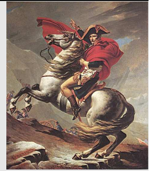
Jacques-Louis David, Napoleon Crossing the Saint-Bernard (1801).

David became Napoleon's official court painter after the coronation in 1804. David (1748-1825) was one of the central figures in the French Neoclassical style of the late-18 th century and after 1800 developed his "Empire style" that borrowed from the Venetian style of warm colors.